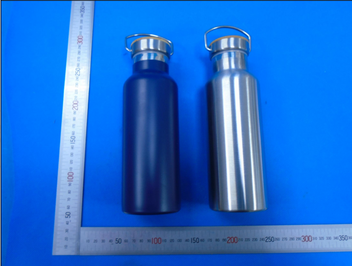
Test Sample photo