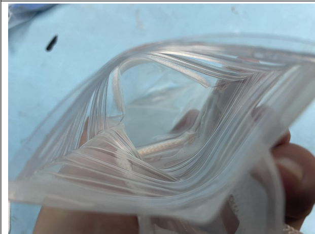
SZ2023060848-1 after test