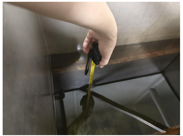
SZ2023060848-1 under test