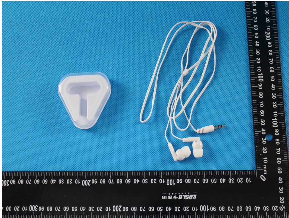
Fig.3 – Overall view of product ----- End of Reprt -----

Any report having not been signed by authorized approver, or having been altered without authorization, or having not been stamped by the “Dedicated Testing/Inspection Stamp” is deemed to be invalid. Copying or excerpting portion of, or altering the content of the report is not permitted without the written authorization of AGC. The test results presented in the report apply only to the tested sample. Any objections to report issued by AGC should be submitted to AGC within 15days after the issuance of the test report. Further enquiry of validity or verification of the test report should be addressed to AGC by agc01@agccert.com .