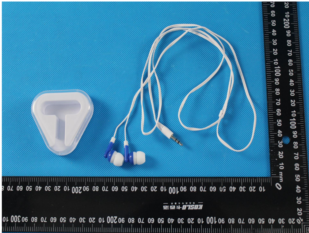
Fig.1 - Overall view of product