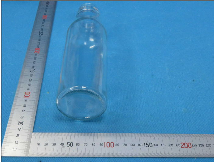
Test Sample Photo