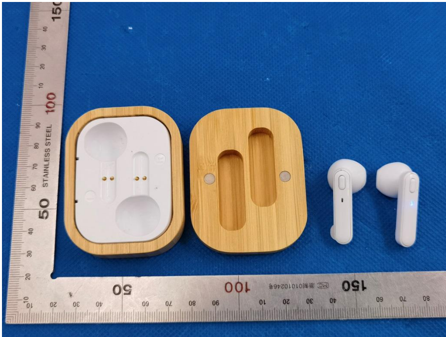
Fig.1 – over view(MO6128)