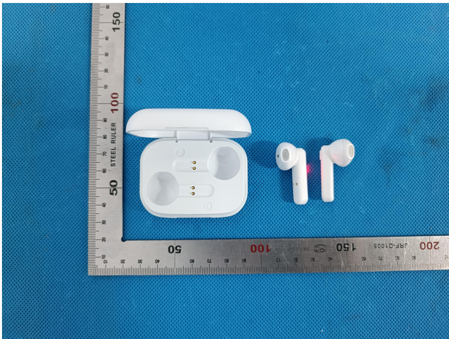
Fig.2 – over view(MO6780)