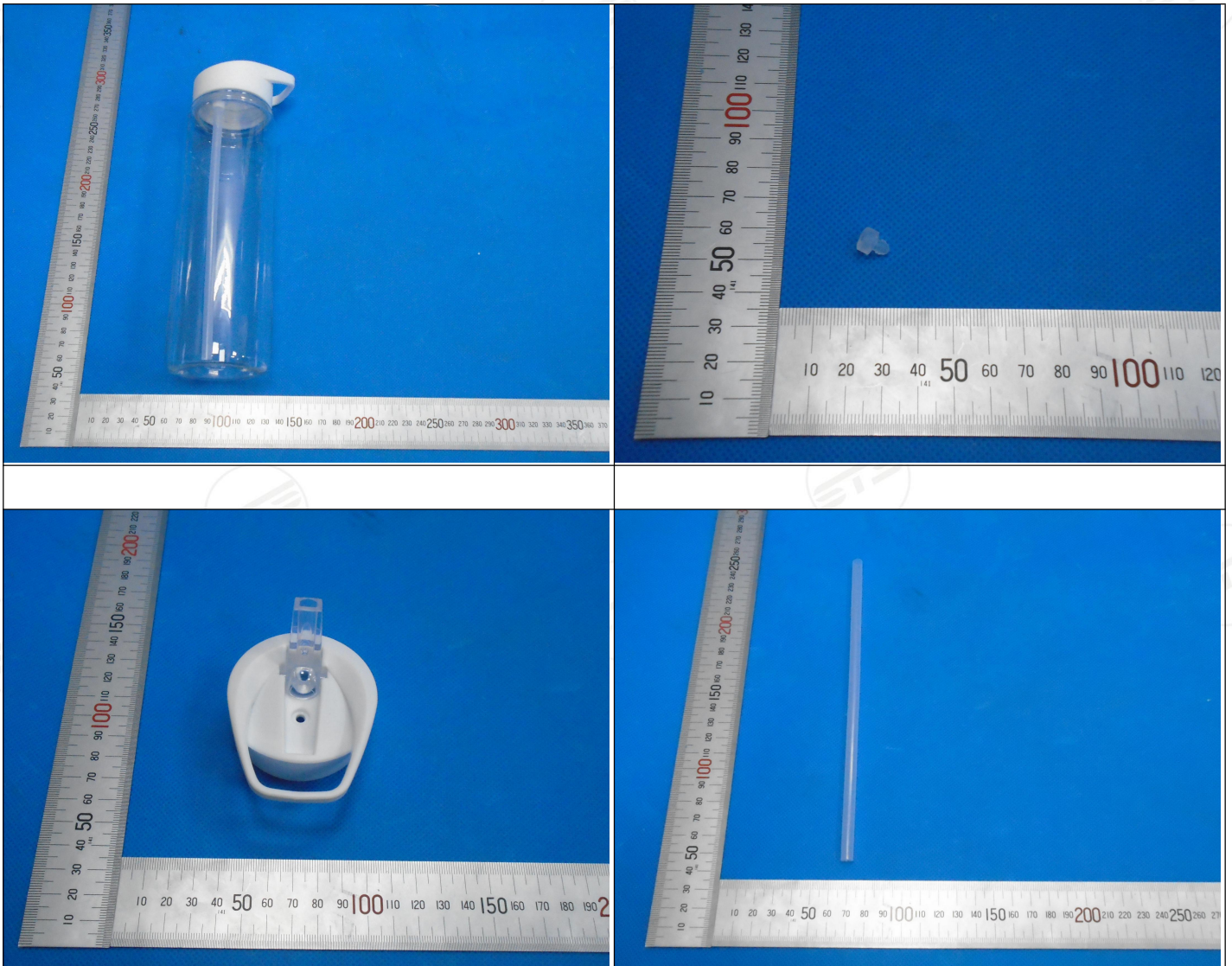
Test Sample Photo

This report is issued by the company in accordance with the requirements of the "Conditions of Issuance of Test Reports" printed in the attached page. Unless otherwise stated, the results presented in this report only apply to the samples tested this time. Partial reproduction of this report is not allowed unless approved by the company in writing.