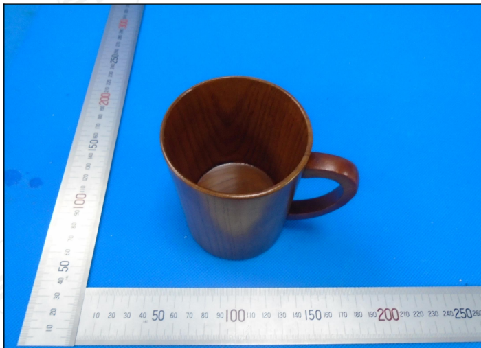
Test Sample photo