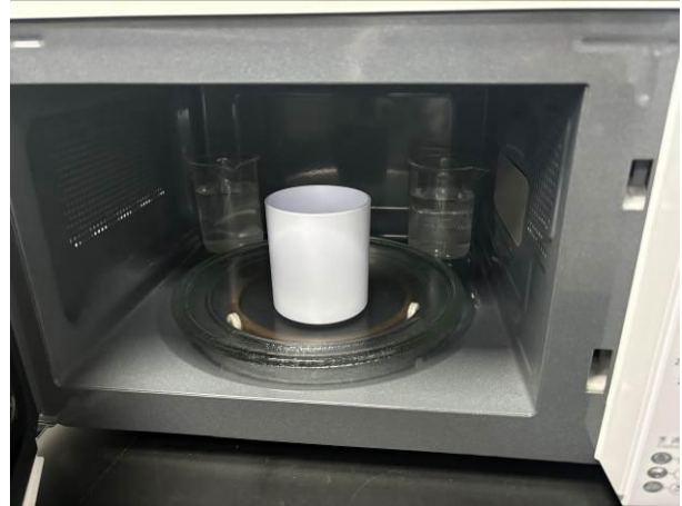
1#-1 During Test