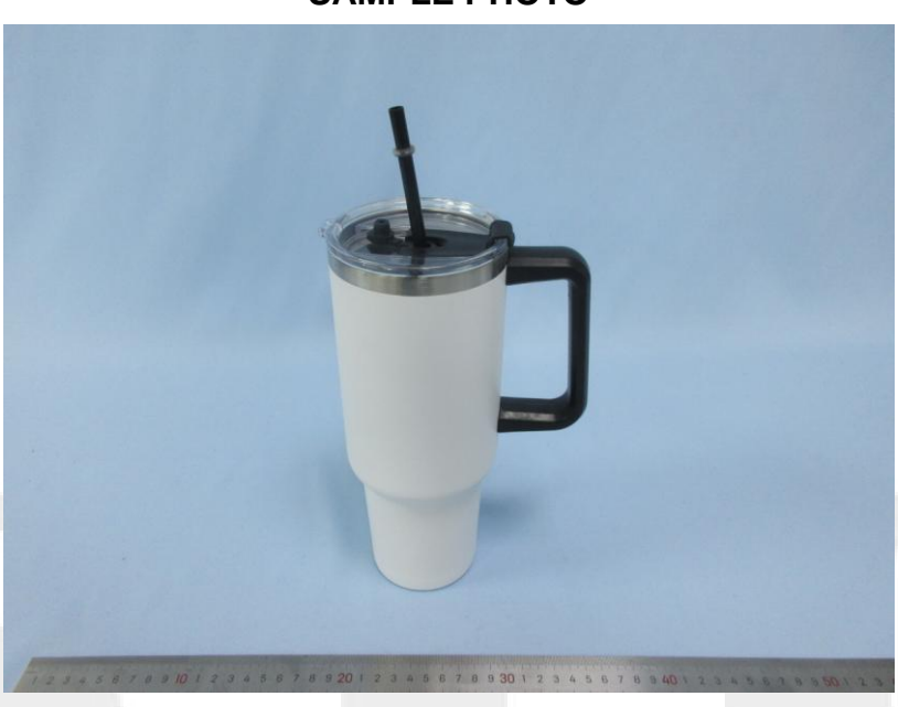
******* To be continued ******