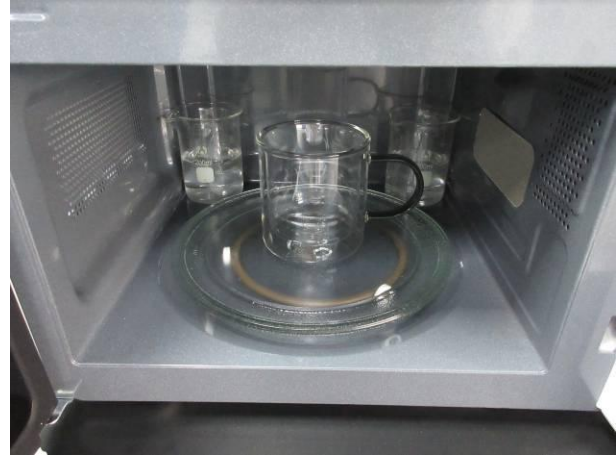
1#-1 During Test