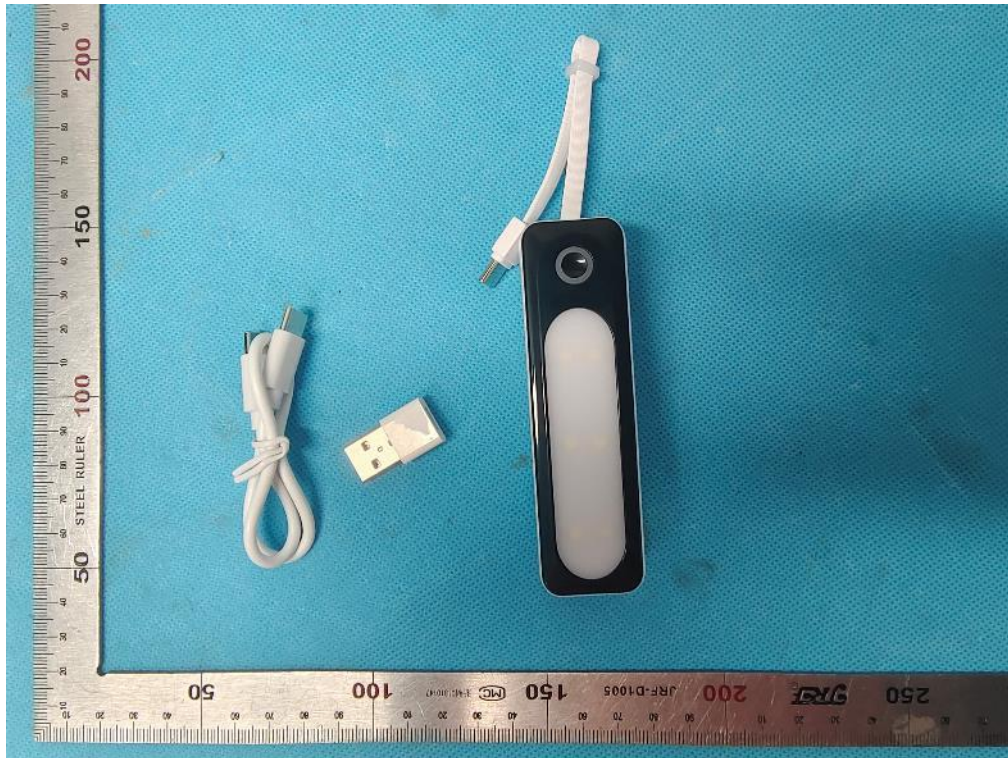
Fig.1- Overall view