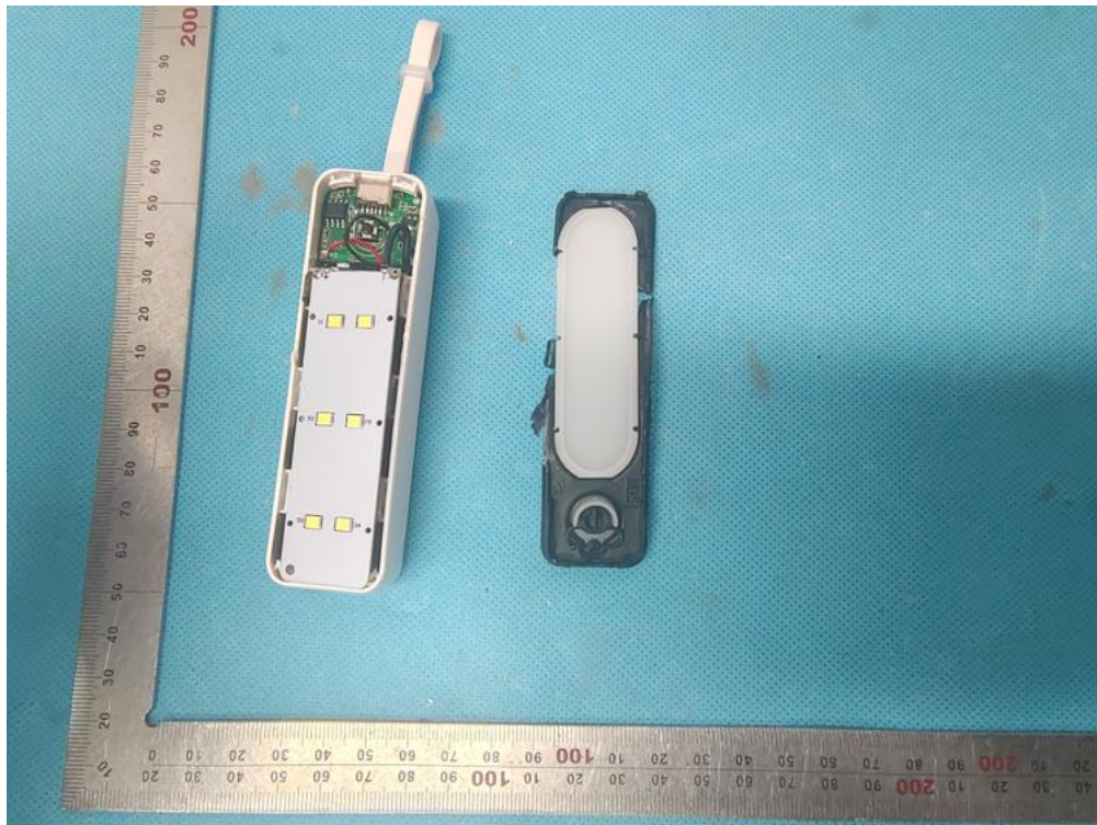
Fig.2- Overall view

Any report having not been signed by authorized approver, or having been altered without authorization, or having not been stamped by the "Dedicated Testing/Inspection Stamp" is deemed to be invalid. Copying or excerpting portion of, or altering the content of the report is not permitted without the written authorization of AGC. The test results presented in the report apply only to the tested sample. Any objections to report issued by AGC should be submitted to AGC within 15days after the issuance of the test report. Further enquiry of validity or verification of the test report should be addressed to AGC by agc01@agccert.com.