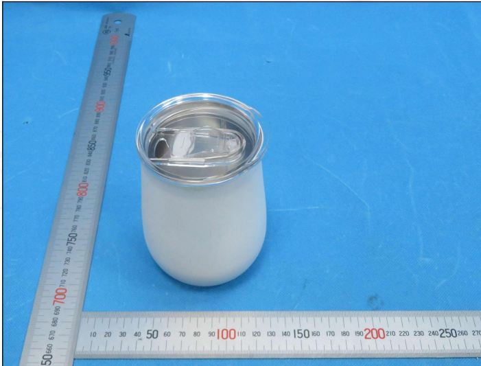
Test Sample Photo