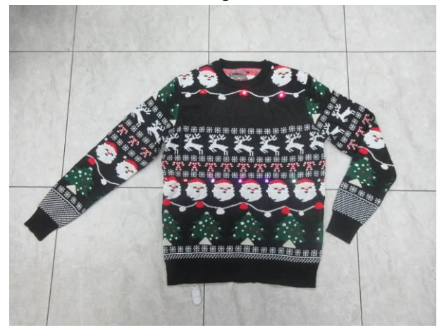
1#-1 After Test