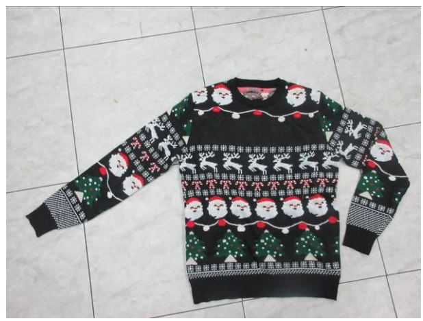
1#-2 Before Test