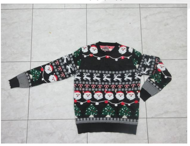
1#-2 Before Test