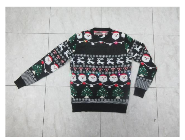
1#-2 After Test

Reference No.: SZ2024041357-3E Date: May. 21, 2024 Page No.: 7 of 10