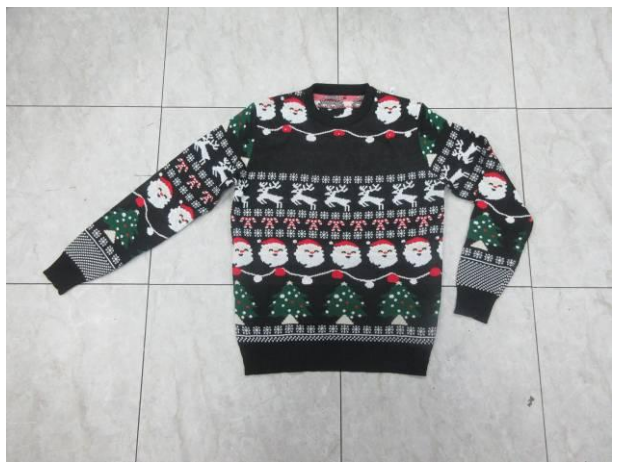
1#-2 After Test