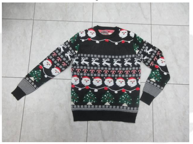
1#-1 After Test