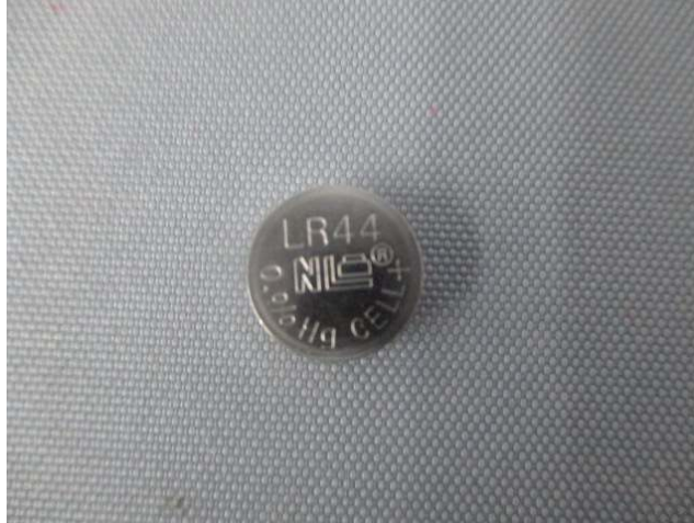
Sample as received